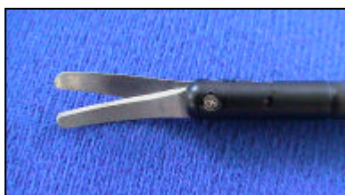
The loading units are easy to put on the instrument.