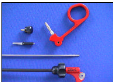
The A.M.I.® Easy-Shear Instrument 5 mm is fully detachable.

The instrument is fully detachable and easy to clean.