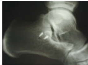
Example of usage... Lateral ankle stabilisation.

The possibility of pinpointing and positioning the tissue before tapping gives total control of placement.